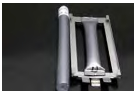
Zero hour sample (prior to exposure) and a sample subjected to an accelerated ageing test after 4000 hours of exposure.

The test is scheduled to last 4000 hours with exposure to a Cl65 Xenon lamp in a weatherometer, in Kly, equivalent to approximately 3 years of continuous exposure in Northern Italy or 2 years in Southern Italy.